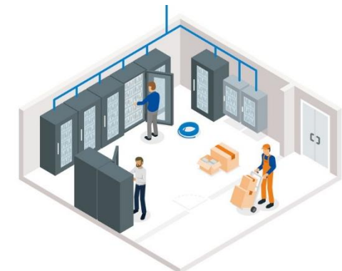
Network and server cabinets