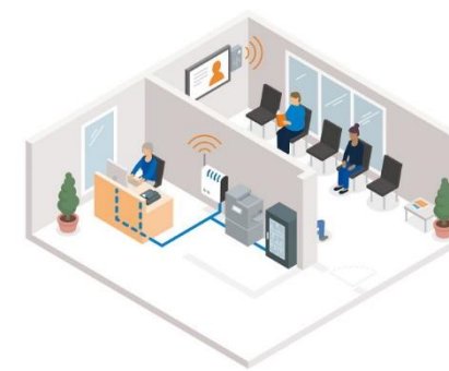
Active network components