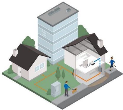
Fiber optic cabling

Discover a broad and at the same time deep product portfolio with over 10,000 products and everything you need to build an entire network. With us you will not only find proven products for standard applications, but also special products for special purposes.